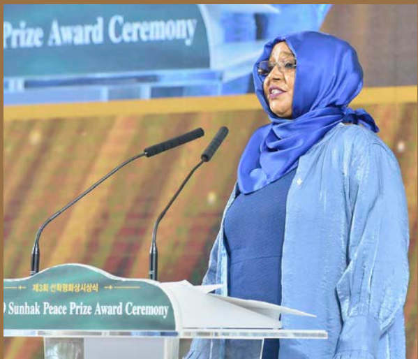
▲ H.E. Seynab Abdi Moalim, The First Lady of Somalia