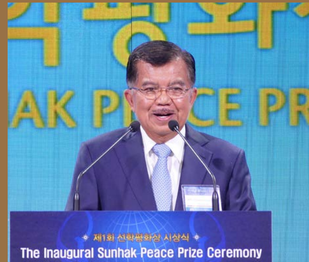
▲ Congratulatory Address: H.E. Muhammad Jusuf Kalla, Indonesian Vice President