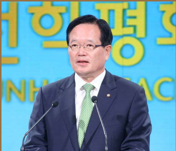
▲ Congratulatory Address: Hon. Ui Hwa Chung, Former Korean National Assembly Speaker